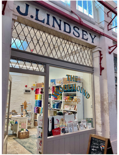
Before and after – the restoration of the Lindsey's unit in the Covered Market