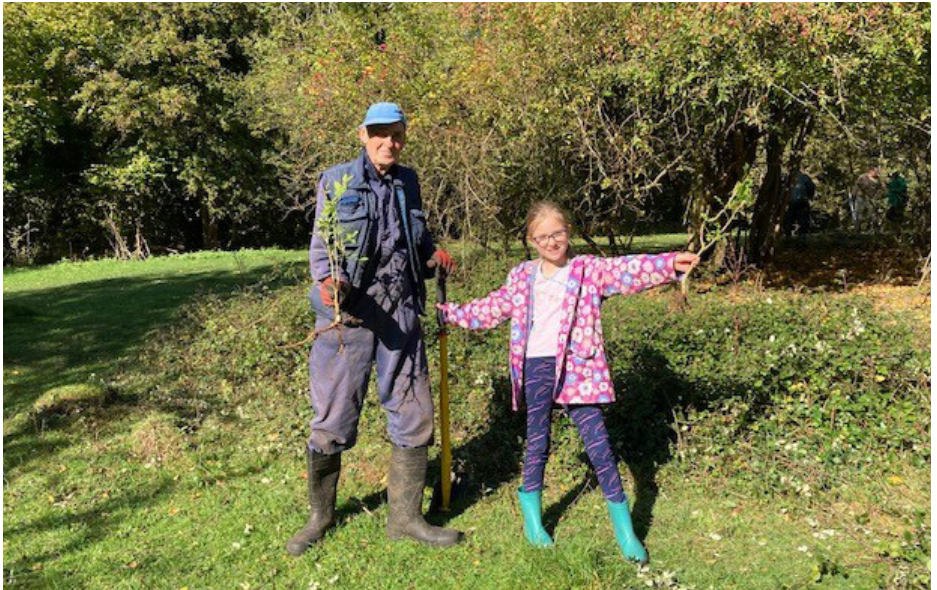
Enjoying our green spaces - volunteers at Kennington Memorial Field